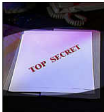
Caption for picture

Have you heard about secret messages written in code I'm sure you have? But have you heard of secret messages you can write with invisible ink. For this experiment you will need : A lemon, saucer, water, teaspoon, toothpick, white paper, lamp.