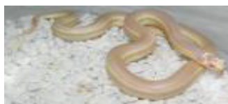
Candy corn snake ( Elaphe guttata )

The best first time snake is a Corn snake, very friendly and placid and tend to be rather nervous but are still ok being pulled about by children. I would suggest buying a book on keeping snakes before you get a snake as a pet to understand all there needs. You would have to feed them dead mice, not for the squeamish.