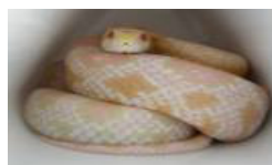
Candy corn snake ( Elaphe guttata )

Why not tell us about your pets , or your special interest share it with us.